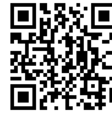
Athens Poet Laureate